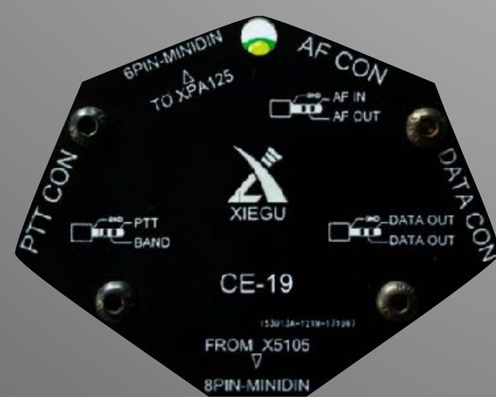
CE-19 interface for Xiegu X5105 & G90

XPA125B 100 watt power amplifier Connection cable for CE-19/CN-20 USB cable for PC connection 12 Volt DC power cable English user manual CE certificate Service card